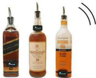
Bottle Tag Wine and spirits