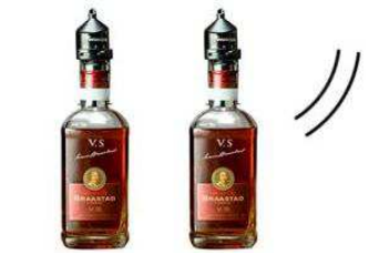
Wireless Spouts Wine and spirits