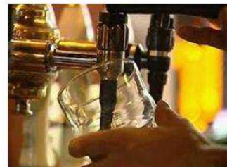
Flow counting Fixed portions