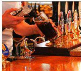
Flow counting Free pour